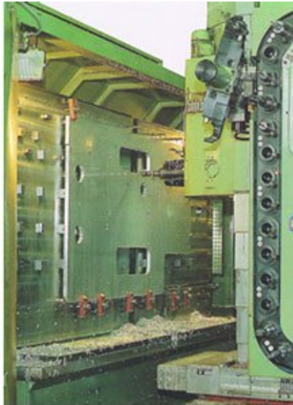
Operation of shoulders and parallelepipedon pieces