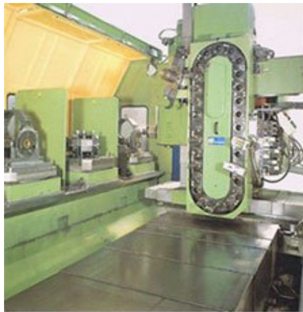
Pendular operation on 2, 3 or more tables