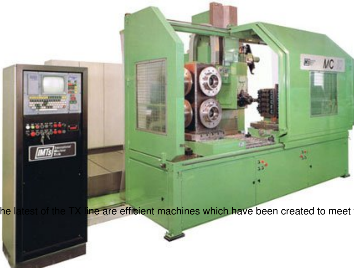
The latest of the TX line are efficient machines which have been created to meet the technical and economic requirements of the industry.