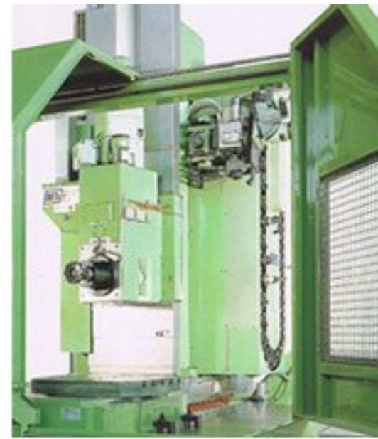
Accessibility for the positioning of parallelepipedon pieces