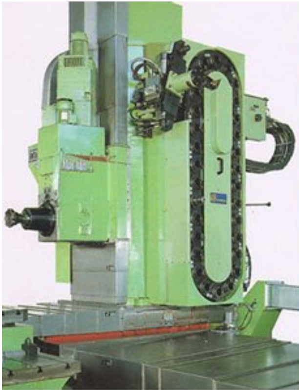
Chain tool change and cross movement